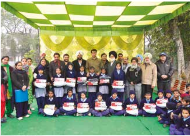
Education Support by Unit at Ludhiana