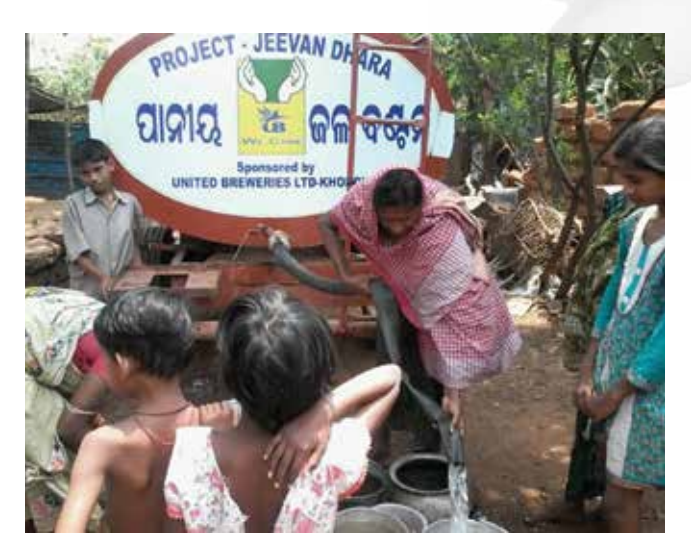
Water Management by Unit at Khurda, Odisha

The CSR activities undertaken by your Company also includes building and maintaining water tanks for providing clean drinking water. Our unit at Mangalore organized drinking water facilities for the Government School benefiting about 250 students by this facility. Our unit at Aranvoyal provided R.O. Water System for the benefit at Government Middle School benefiting about 225 students and 12 teachers.