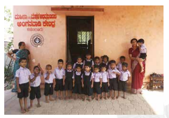
School Uniform distributed by Unit at Mangalore

UBL provides school uniforms, books, stationary, furniture etc. to promote primary education in the vicinity of its brewery locations. Our Mangalore unit distributed uniforms to the children of Anganavadi at Kudumbur. Our unit at Nanjungud provided free computer education training for higher primary school children in Hullimavu and K.S. Hundi Village, near the unit location and around 160 students have undergone the training. On the request of Zilla Parishad High School at Kothlapur, our unit at Kothlapur donated furniture for the school at Malkapur. Our unit at Cherthala, in the seventh consecutive year, distributed school bags, uniforms, umbrellas, shoes etc. to around 120 students of the local Government Local Panchayat School located close to the Brewery.