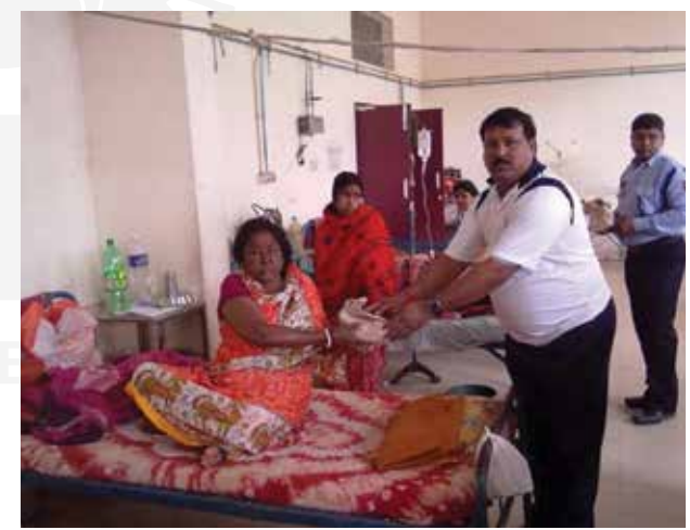
Health Care organized by Unit at Kalyani.

Our unit at Aurangabad adopted a school "Gurukul Vidyamandir" at Bhangsi Mata Gad and provided Doctor facility with free medicines and pathology assistance. About 40 students were benefited through by this initiative. Our Unit at Srikakulam organized an Eye Screening Camp at a school premise in the Bantupally Village benefiting about 120 villagers. Regular medical camps are organised by our units at Ludhiana, Odisha, Aurangabad and Nanjungud where free consultation and medicines are provided.